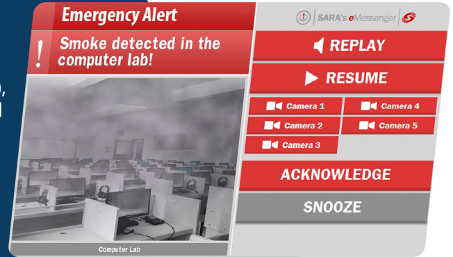
Desktop alert with video paging

SARA is a proven technology with significant ROI across the health care spectrum (from acute care to senior living), K-12 and higher education, hospitality, manufacturing and government. Let us develop a customized SARA system to improve your organization's risk management with situational awareness. Because ignorance isn't bliss... it's dangerous.